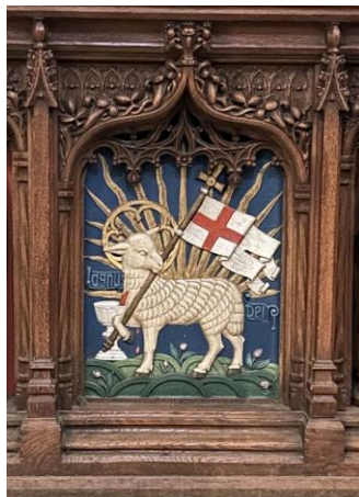
Center panel of an altar in St. Giles Cathedral, Edinburgh

The Gifts of God for the People of God. Take them in remembrance that Christ died and rose for you, and feed on him in your hearts by faith, with thanksgiving.